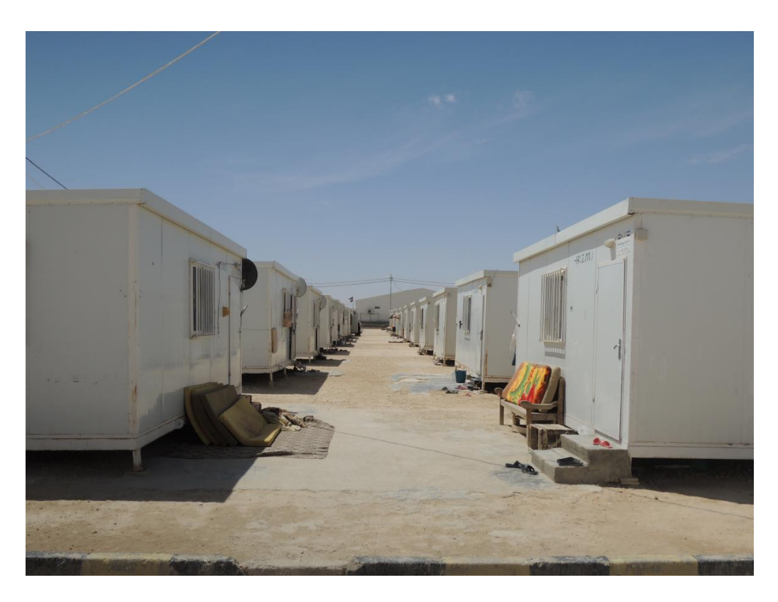
Figure 3. The Emirati-Jordanian Camp in Jordan.