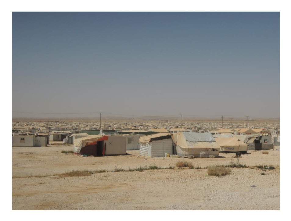
Figure 1. Zaatari Camp (Source: Author 2015).

Refugee camps, especially in their emergency phases, are places where everything seems to be similar, repetitive, and modular. This impression is not only due to the unified shelter unit that is usually distributed by UNHCR¹ (traditionally a tent, and recently caravans, prefabs, and developed T-Shelters), but is also due to the camps' ordered layout and hierarchical plan (Figures 1–3). This generates an assumption that all refugees are the same, and a feeling of a collective identity emerges: "All of us carry water from the same water tank...all of us go to the same toilet...all of us go to the same mall....and all of us have the same visa [WFP² debt cards]...we are all the same ... we are all refugees"—a young man from Zaatari camp in Jordan explained. This is true, but it is definitely not the whole truth. When a villager from Daraa was asked about how he feels to be in the same camp with city dwellers, he replied, "I felt they are different... the prestige and lifestyle which they are used to does not fit in here...I thought they should be living in Amman—I am even shy to ask them what happened!". At the same time, a man from Damascus complained about the traditions of villagers from Southern Syria; "Their weddings last for weeks and they are mixed [men and women]! In Damascus, it was just one night ... women celebrate by themselves and men celebrate by themselves!"