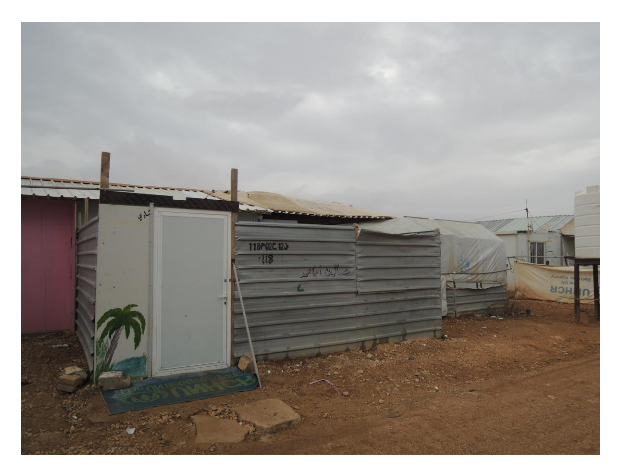
Figure 4. Salon Um-Ahmad for brides with a pink door attached to their house.

These cultural differences appear in the building and housing traditions within the unified shelters. For instance, another young man who used to live in Damascus furnished his caravan with sofas and a table similar to salons you find in cities, whereas the houses of the Bedouins (nomads) from Daraa and Homs could be identified by their extensive use of tent sheets to demarcate space and construct the dwelling. Yet, these traditions and cultures mix together. In fact, the camp may present itself as an opportunity that would never have happened for some in Syria. A young man from Zaatari explained about how people from his village changed; "They got mixed with new societies, got introduced to new people, saw how they used to live...back in the village they were closed ... now they expanded their horizons." This observation appears to be valid in an economic sense as well. While many families suffer from the lack of economic opportunities in camps like Zaatari and Azraq in Jordan, some are very well-off. A man sitting inside a house with a small rundown fountain, no different from the houses next to it (Figure 4), explained, "We have a salon for brides attached to our house ... we had six young girls working for us ... and sometimes we prepared 16 brides a day!" This gives an idea of the different levels of income inside the camp.